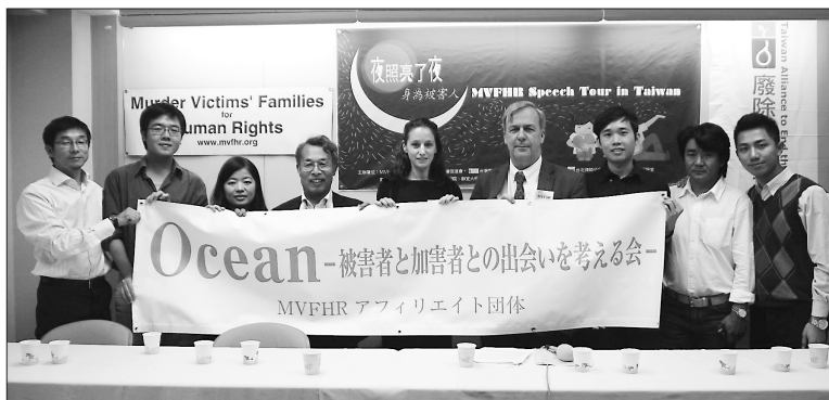
The MVFHR group, with local allies, at a press conference in Taipei