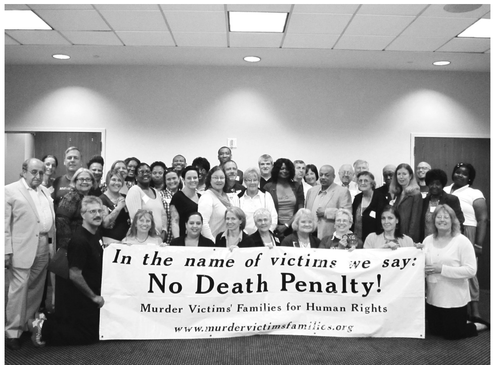
The group at the conclusion of the seminar

"This meeting helped us express our efforts to lead positive lives, and to plan further work toward our goal of abolishing the death penalty in the U.S. and worldwide."