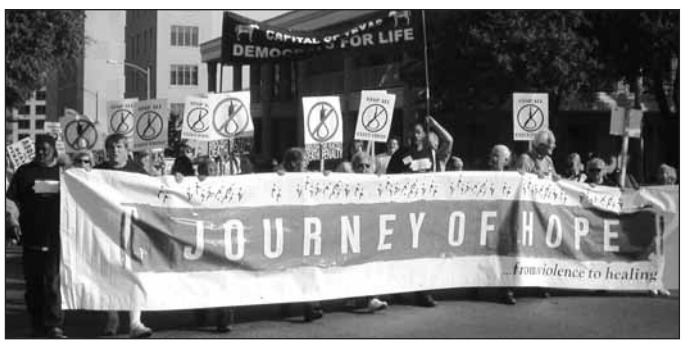
Journey of Hope participants march to the Texas state capitol.

in 1999 that the age of eligibility for the death penalty should be 16, not 15, it took Virginia ten years to pass a law bringing our statute in line with that ruling. This time, the bill passed overwhelm-