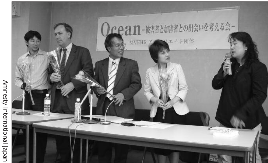
Amnesty International Japan